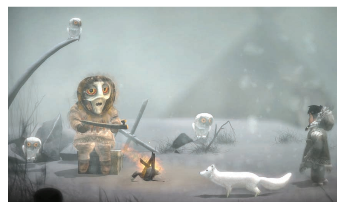
Screenshot from the video game Owlman, a Cook Inlet Tribal Council initiative.

Rasmuson Foundation also uses impact investing as part of its programs. One example was a $1 million program-related investment (PRI) in the Cook Inlet Tribal Council's (CITC) video game initiative. Rasmuson Foundation, the largest private foundation in Alaska, had maintained a traditional philanthropic relationship with the Native organization for nearly two decades, funding such initiatives as capital support for CITC's service centers. "Through this PRI the foundation saw the potential power of video games as a way not only to create a revenue stream to sustain CITC's mission, but also to