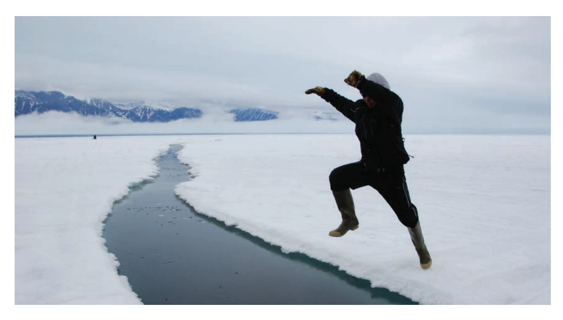
Inuk from Mittimatalik (Pond Inlet, Nunavut, Canada) jumps over lead in the sea ice en-route to the rich hunting grounds on the floe edge. Travel is increasingly dangerous and unpredictable as sea ice seasons grow shorter and New Year round shipping make conditions even more unstable. Photo by Anne Henshaw June 2015.

Some funders support indigenous peoples' travel to global meetings, such as sessions of the UN Permanent Forum on Indigenous Issues, or regional networking events, like the