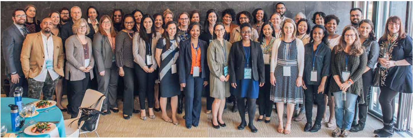
Attendees at Kresge Foundation's first FUEL convening.